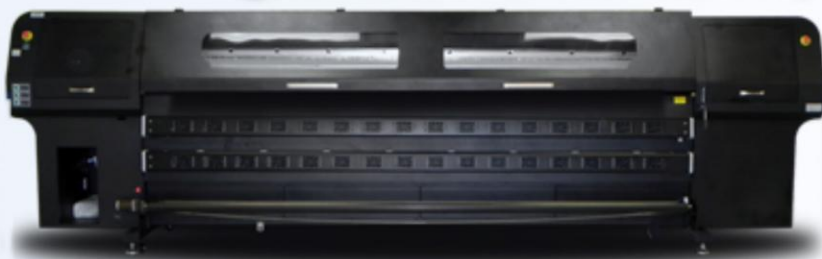
SPECTRA Polaris Print Head 35pl