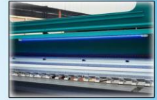
Dual silent linear guide and LED light