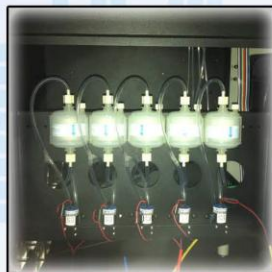
Ink supply system with cobetter® filter