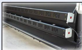
Dual thermal drying fans